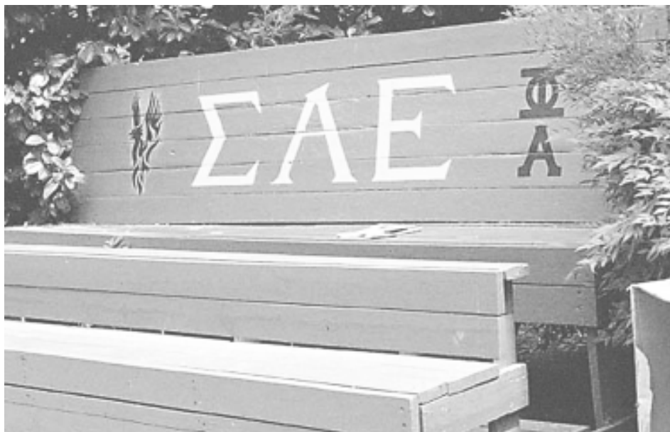
The traditionally painted bench at the old North Carolina Nu Chapter house